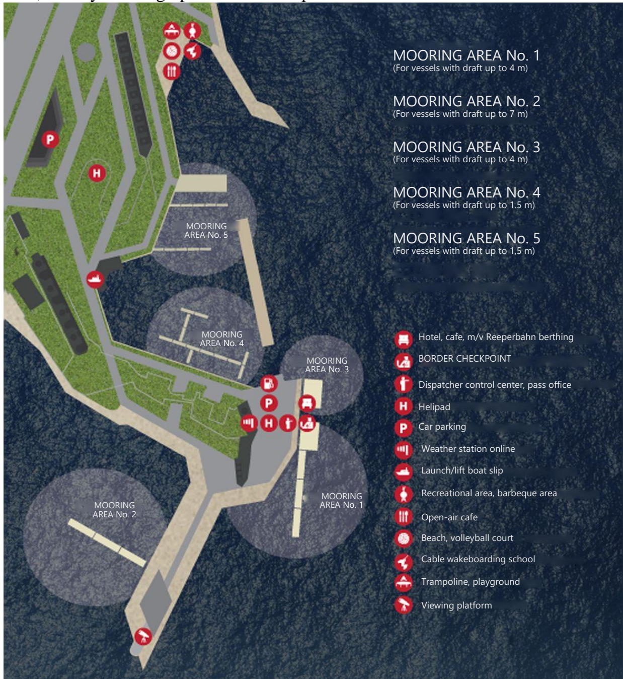
Checkpoint location map for the sea port Big Port of Saint Petersburg

The results of sanitary and quarantine control shall be made by stamping transport documents as appropriate, and in cases established by the laws of the Russian Federation, also by drawing up the relevant report.